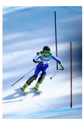
Vancouver 2010 Super combined (W)