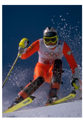
Nagano 1998 Giant slalom (W)